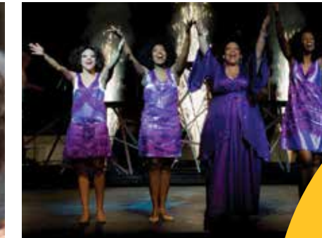
SafeHouse Denver, Boys & Girls Clubs of Metro Denver and Ignite Theatre are just a few of the organizations that benefit from online giving through ColoradoGives.org.