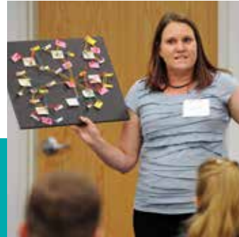
Nonprofit innovators practice their pitches with support from their coaches.

Many of our grants support multi-year programs, such as the Behavioral Health Integration in Pediatric Populations initiative. This collaborative effort is integrating behavioral health into primary care to help pediatric professionals address the behavioral health needs of children from zero to five years old. Overall, we have committed $7.8 million in mental wellness grants over five years.