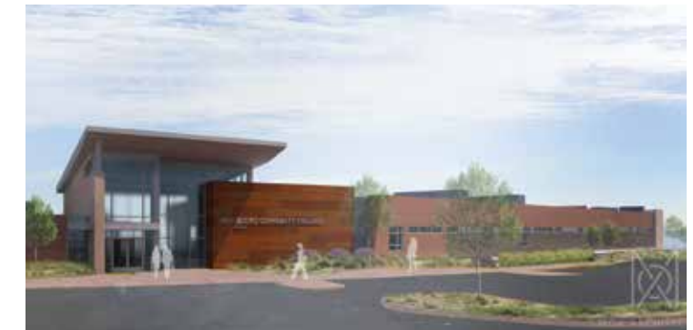
Architectural rendering of new health sciences building at Red Rocks Community College – Arvada campus.

The college broke ground in July 2015 and the facility is expected to open in time for the fall 2016 semester. Once completed, it will transform the Arvada location into a full-service campus dedicated to the health and wellness of Jefferson County and surrounding communities.