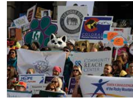
Attention-getting signs and costumes are the hallmark of the Colorado Gives Day Rally.